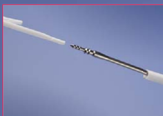
Standard Tunneler Antegrade