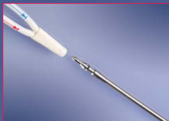
Raulerson Tunneler Retrograde

Left sided Jugular procedures are easier with the Retrograde OTW approach. It eliminates the dexterous maneuver necessary to position the distal end of the sheath in a manner to facilitate directing the catheter to the caval/atrial junction.