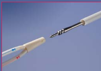
Standard Tunneler Retrograde